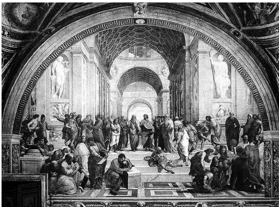
Figure 1: Scuola di Atene